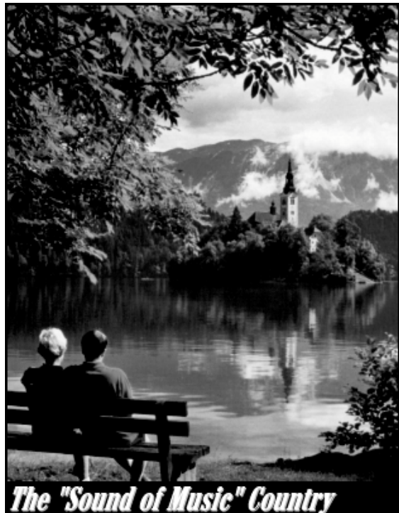
The "Sound of Music" Country

*The above rates are for payment by credit card. See Res Form ( on back ) for discount cash and check rates.