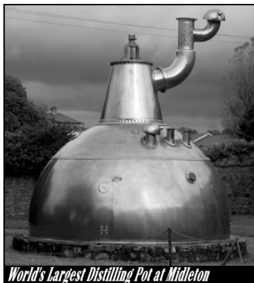
World's Largest Distilling Pot at Midleton

MAR 24 - RING OF KERRY: Full Irish breakfast at our hotel. Today, we will enjoy a full-day of guided sightseeing of the picturesque Ring of Kerry, the popular scenic drive on the southwestern tip of Ireland. The route covers the 100-mile circular road, starting from Killarney, heading around the Iveragh Peninsula and passing through Kenmare, Sneem, Waterville ( favourite holiday spot of Charlie Chaplin that now has a statue of him to commemorate his love of the place ), Cahersiveen and Killorglin. Popular points include Muckross House (near Killarney), Staigue stone fort and Derrynane House, home of Daniel O'Connell. Just south of Killarney, Ross Castle, Lough Leane, and Ladies View ( a panoramic viewpoint ), all located within Killarney National Park, are major attractions located along the Ring. Return to our hotel in Killarney for dinner and overnight. (FB, D)